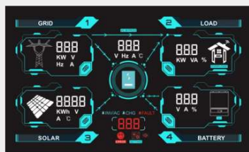
Dual PV LCD Display